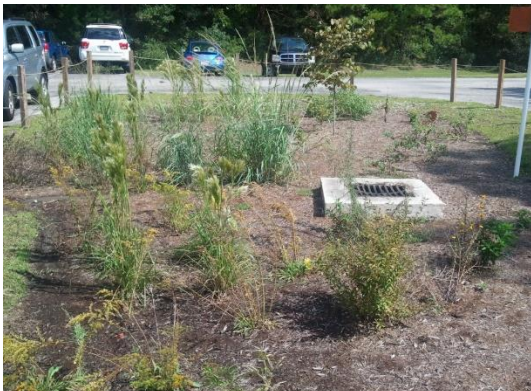
Bradley Creek Elementary BMP