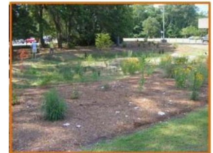
Bradley Creek Elementary BMP