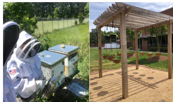
ESI Environmental Steward, Pfizer in Sanford, maintains beehives and an herb garden managed by their green team for use in their company café.