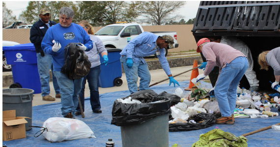
ESI Partner, Cape Fear Public Utility Authority, conducted a waste sort to educate employees on recyclable items that can be diverted from landfill disposal.