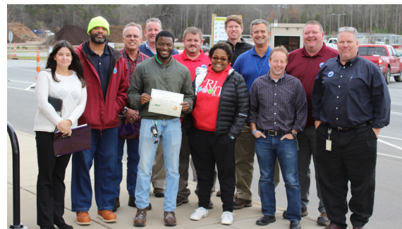
Mecklenburg County Solid Waste, an ESI Rising Steward, hosted ESI members for a training on internal auditing of environmental management systems.