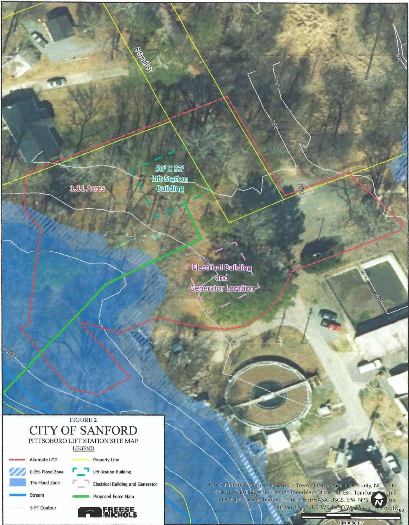
FIGURE 2 CITY OF SANFORD PITTSBORO LIFT STATION SITE MAP