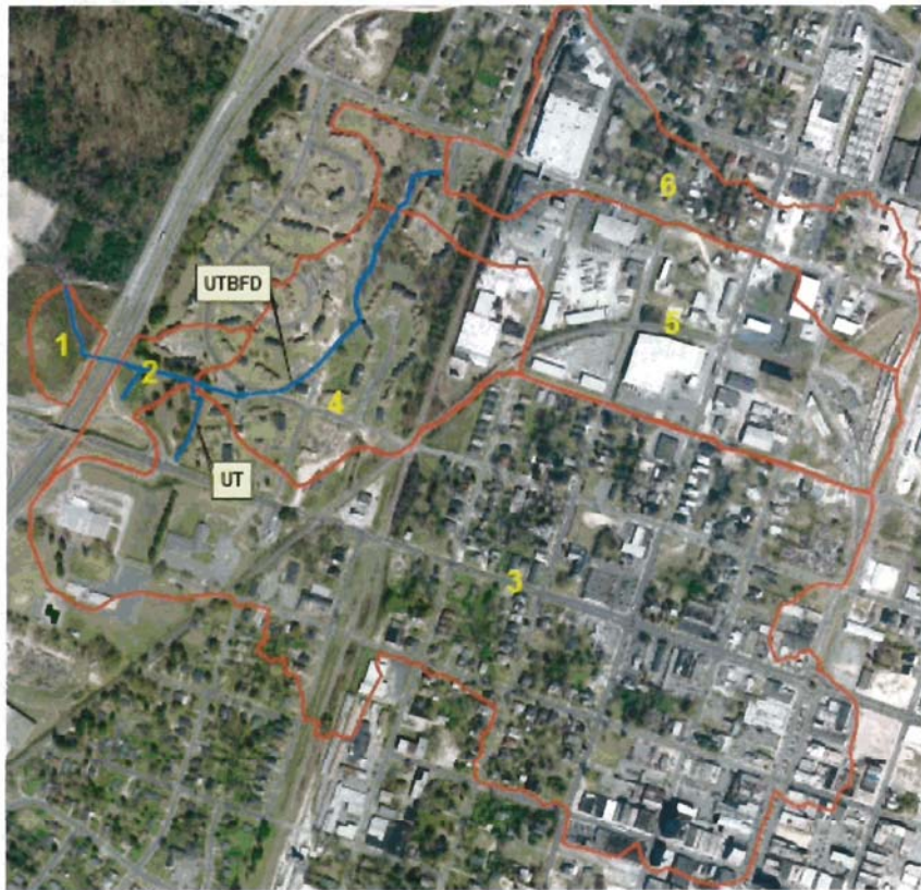
Figure 2 Map of Sub-watershedsshowing the Industrialized/Urbanized Nature of the Basin