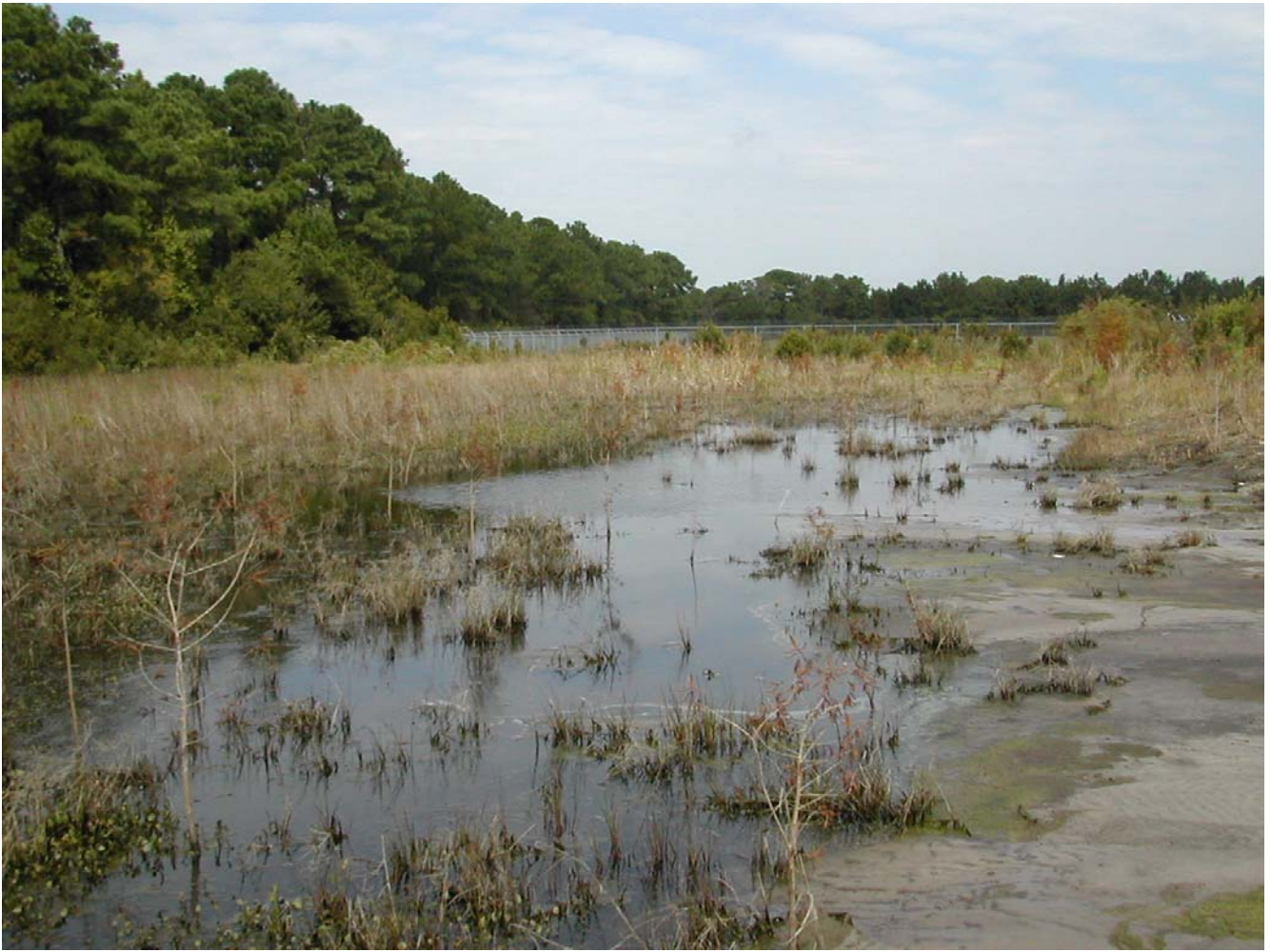
Photo 3. West Cell - above weir