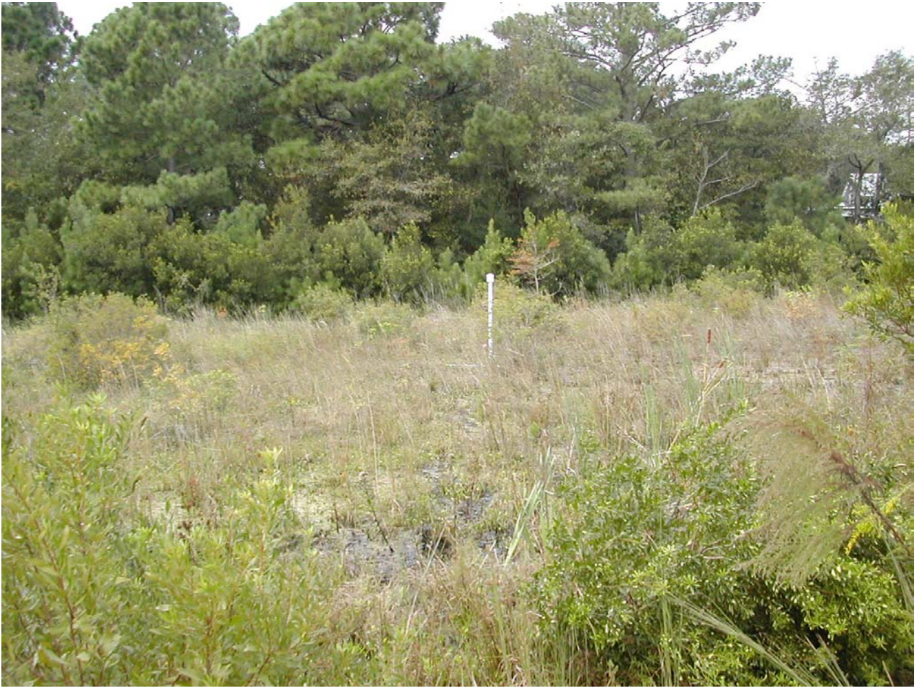
Photo 4. West Cell - groundwater gage