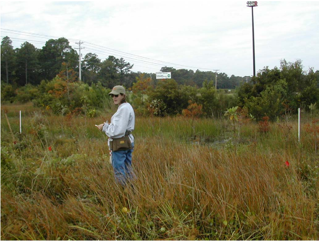
Photo 2. East Cell Vegetation Plot