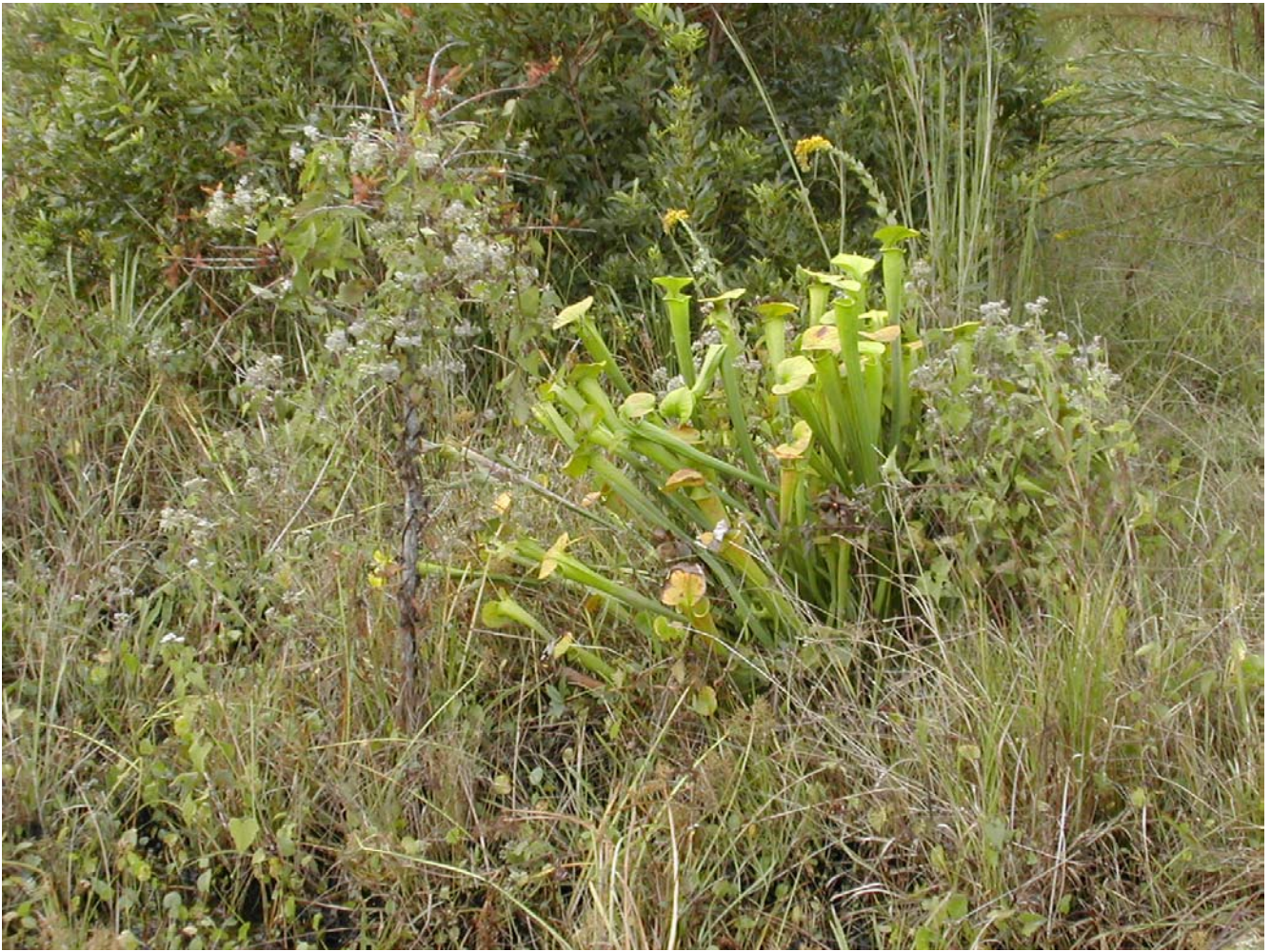
Photo 5. Pitcher Plants found at the site