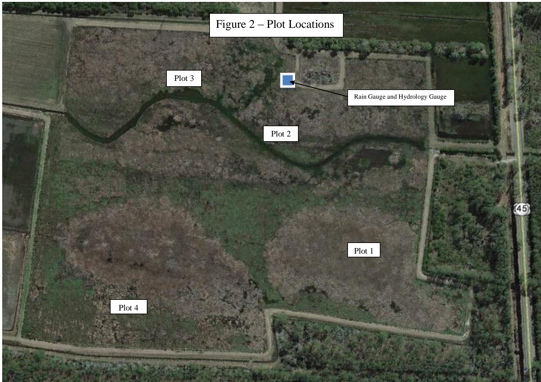
Figure 2 – Plot Locations