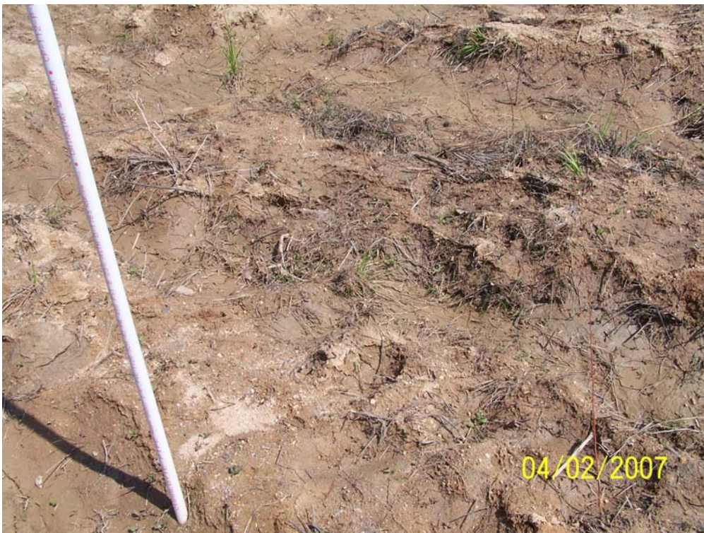
Veg Plot B – Herbaceous sampling corner post construction