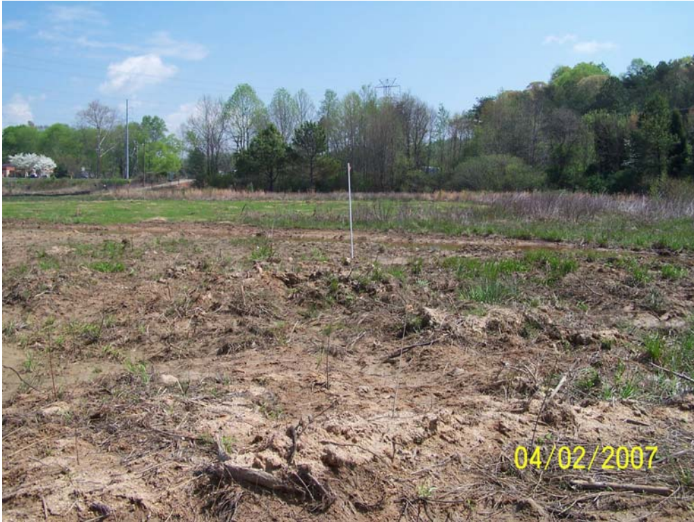
Veg Plot B – Facing NW