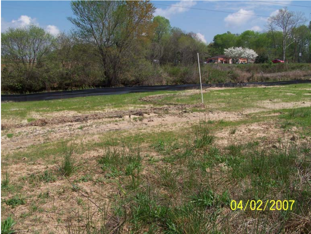
Veg Plot A – Facing NE