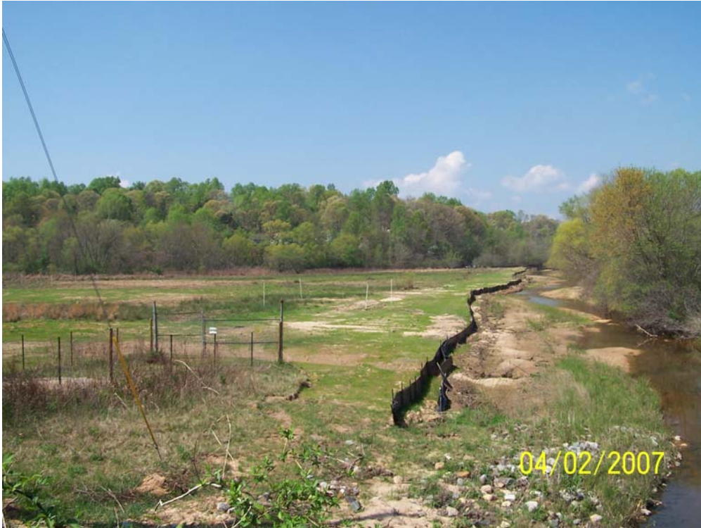
Site overview from bridge on Hwy 21