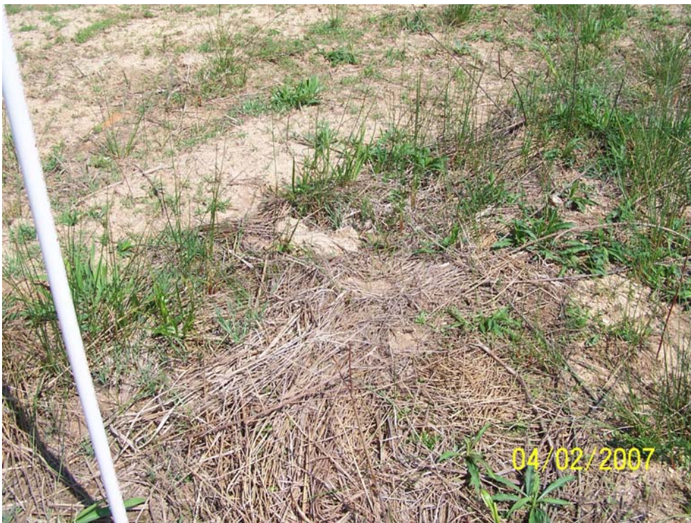
Veg Plot A – Herbaceous sampling corner post construction