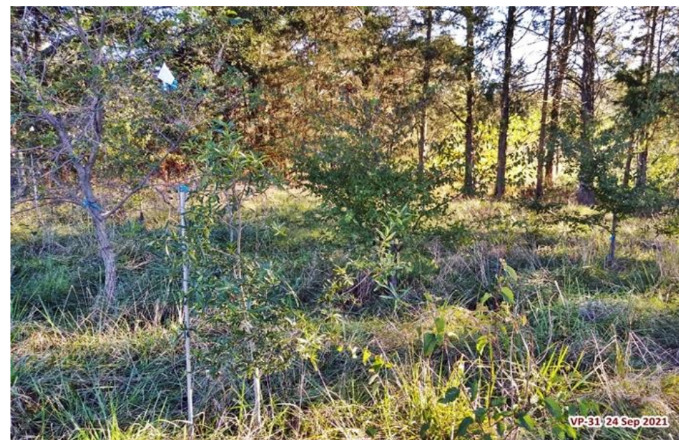
CVS VegPlot-31: MY-5 Sept 2021 (from SW corner)