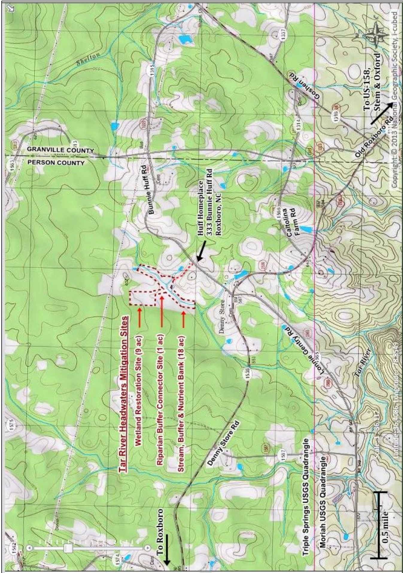
Figure 1. Project Vicinity Map: Tar River Headwaters Wetland Restoration Site and related mitigation projects on the Huff Farm property, Person County NC, Tar-Pamlico River HUC# 03020101-0102. DIRECTIONS: From US-158 in Berea, Granville County NC, turn right (northwest) on Old Roxboro Rd, which becomes Denny Store Rd where it crosses into Person County. Turn right (north) on Bunnie Huff Rd, go 0.4 mile, and turn left into the driveway just past the Huff Homeplace sign. Proceed through the gate at end of driveway to the project sites.