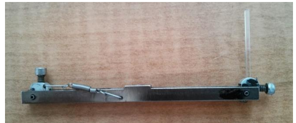
Figure 2. Pollen Collection Rod (Plastic Rod on Right)

For one minute out of every ten minutes, the retracting head spins and the pollen collection rods drop down to sample the air (Figure 3). The air is sampled for 24 hours, and then the rods are removed.