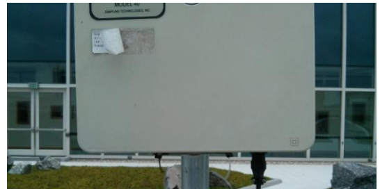
Figure 3. Pollen Collection (Spinning near Bottom)

In the lab, the pollen rod is stained with Calberla's stain which turns the pollen grains pink. The rod is analyzed under a microscope at 400X magnification (Figure 4). The stained grains are categorized (tree, weed, or grass) and counted.