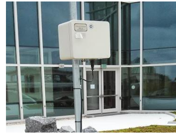
Figure 1. Rotorod Pollen Sampler

The sampler contains a retracting head with two plastic pollen collection rods (Figure 2). One side of the sampler rod is coated with silicon grease which causes pollen to adhere to the rod when it is exposed to the air.