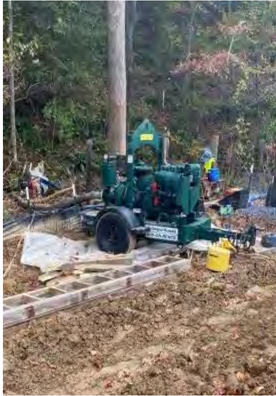
Photo- Impervious dike and pump around for culvert extension (10/14/21)