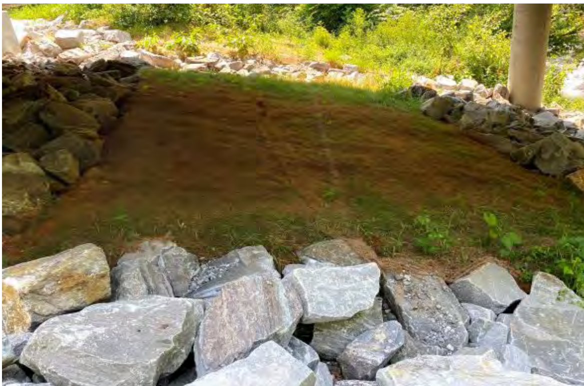
Photo- BR-0124 : Riprap and matted stabilization below bridge (8/25/2021)