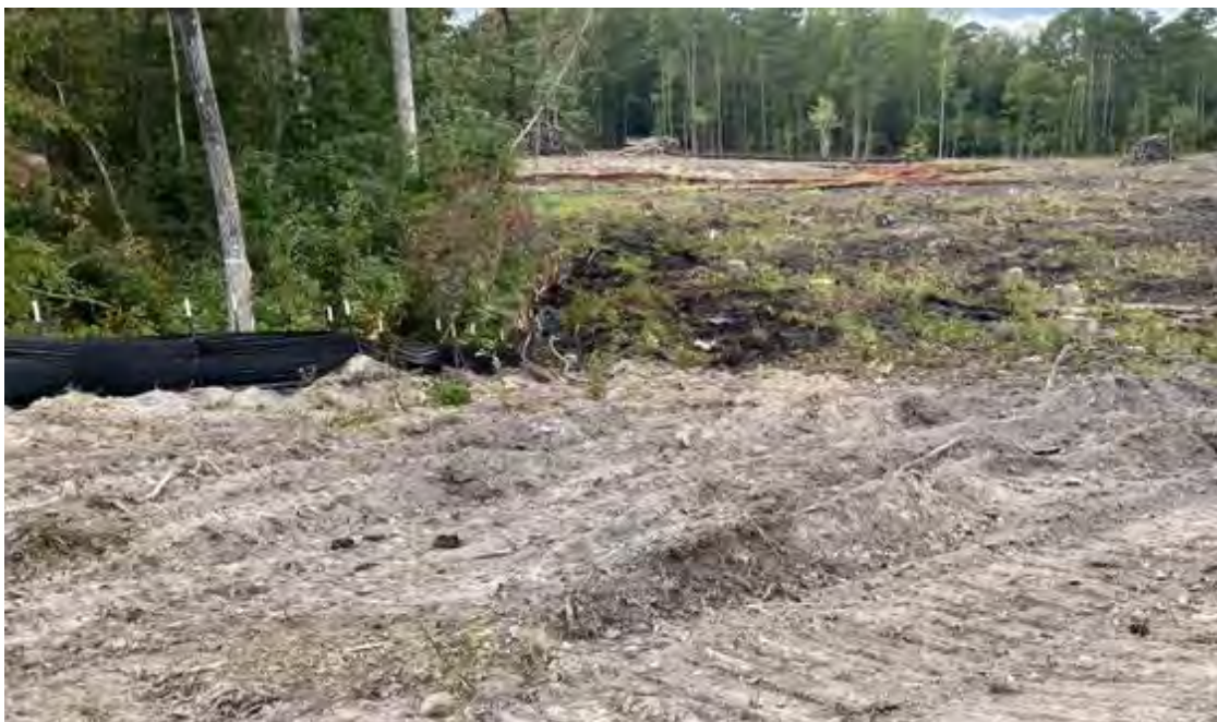
Photo- Active Clearing, ESAs delineated, and Silt fence installed. (10/4/21)