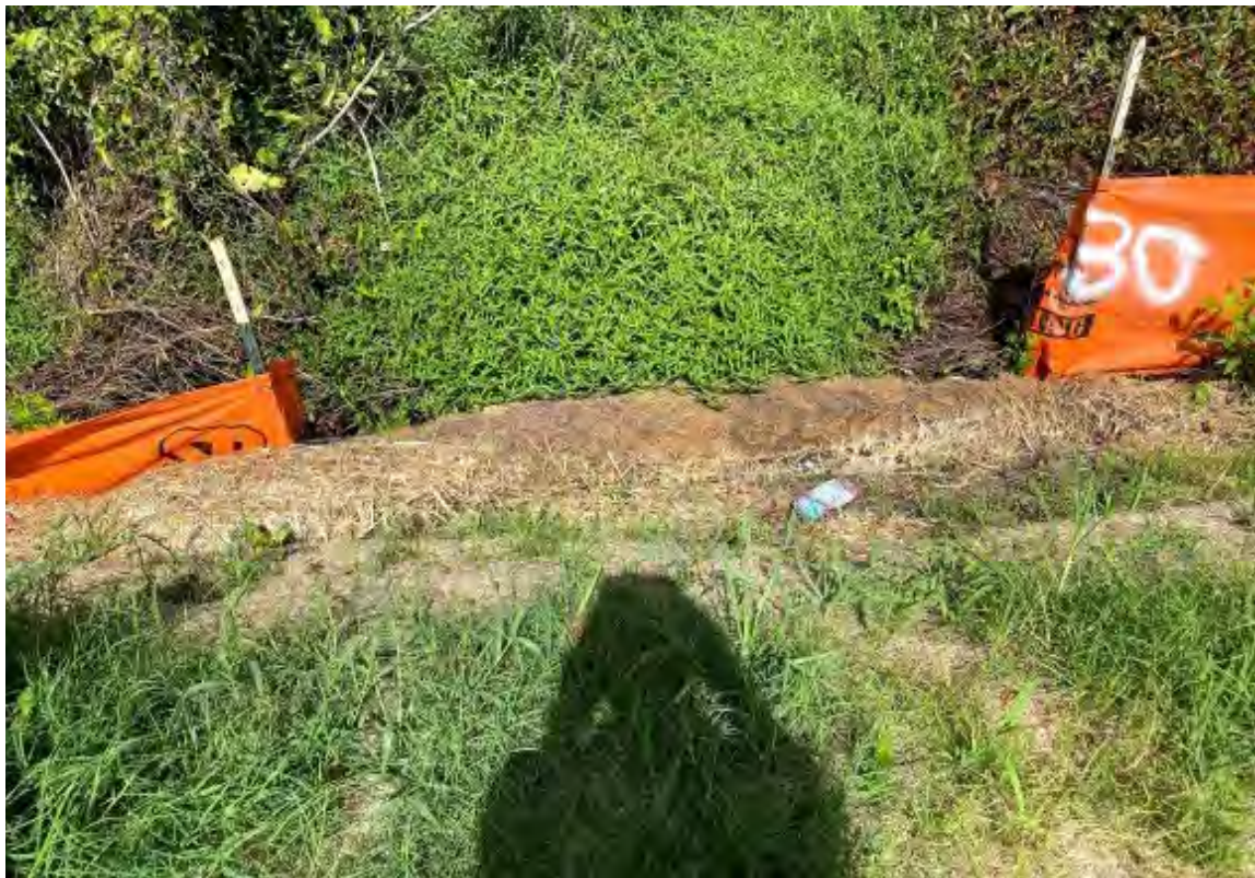
Photo- Silt fence and wattle breaks installed and maintained (8/31/21)