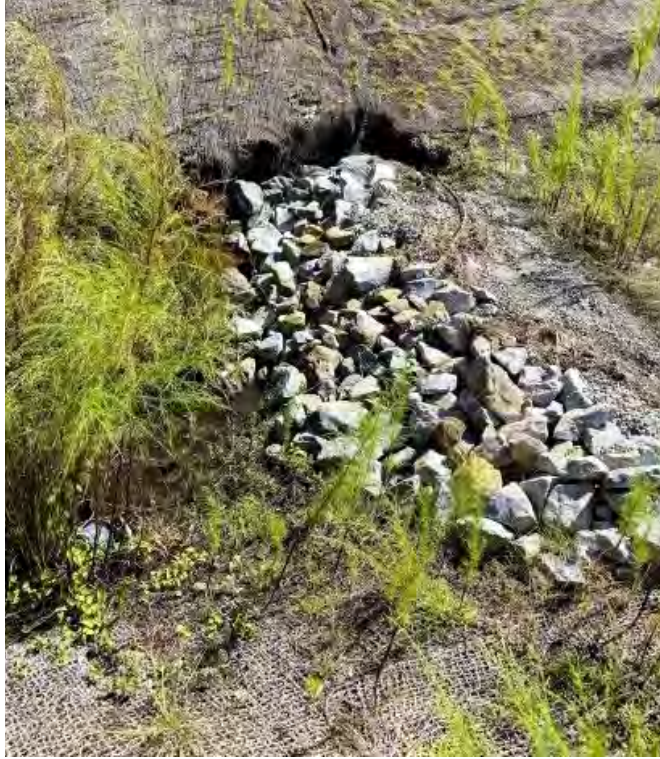
Photo - End cutting around Temporary Rock Silt Check-Type A. (9/23/21)