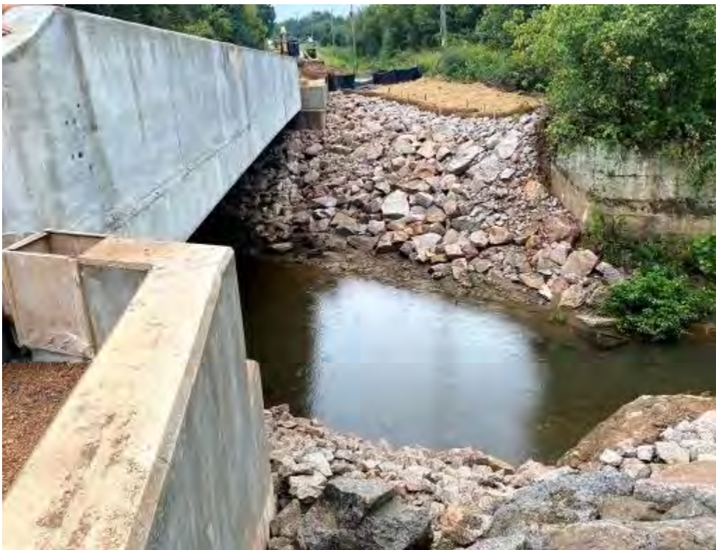
Photo- Bridge #255 over Grant's Creek – Area around Bridge being stabilized (9/16/2021)

This is a 0.095-mile-long bridge replacement project with a total budget of $547,804.92 that was let out of the Division office. This project was approximately 60% complete and had received no ICAs at the time of our review. Self-inspection records and monthly REU inspection reports were reviewed and appeared consistent and well maintained. The approved plan was adequate. Throughout the site, Coir Fiber Wattles with PAM had been used in place of TRSC-B. These substitutions had been approved by the FOE. This project was transitioning to the final grade phase and had installed measures the day prior after grading had been completed. One TRSC-A with Matting and PAM had been installed but did not extend all the way across the ditch and may start to wash around during future rain events. Overall, this site was in good condition and appeared to be transitioning properly between phases.