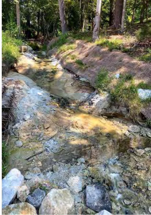
Photo- BR-0125 : Permanent Ditch (left) and Stream Relocation (Right) (8/25/2021)