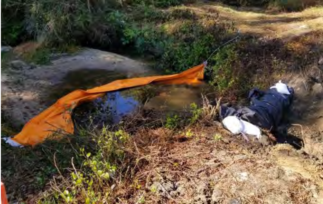
Photo- Impervious Dike and Turbidity Curtain installed downstream (10/19/2021)