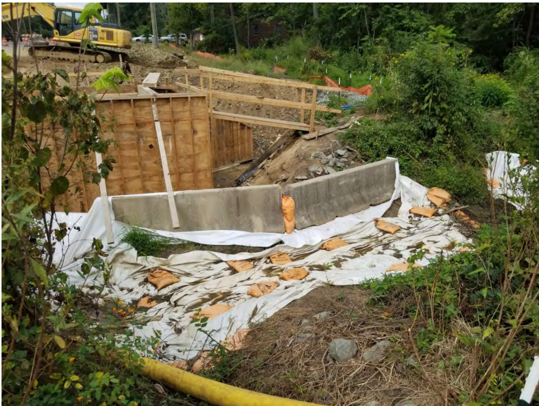
Photo- Lined Stream Diversion and Impervious Dike around Culvert installation (9/17/21)