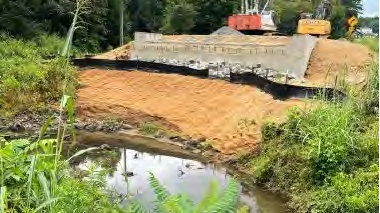
Photo- Bridge #64 over Beaverdam Creek- Finished End Bent stabilized (9/16/2021)