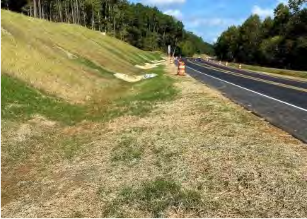
Photo- Vegetation establishing and TRSC-A with PAM installed (10/5/21)