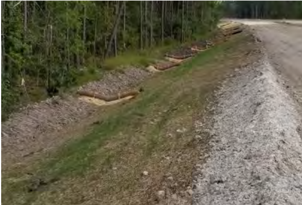
Photo- Grass establishing in ditch with Wattles and polyacrylamide (PAM). (10/4/21)

One area of Temporary Silt Ditch (TSD) needed to have the berm regraded so that it would function as intended and direct flow down the ditch. Overall, this project had some areas in need of maintenance but did not show signs of offsite sedimentation. Inactive or completed areas had adequate groundcover.