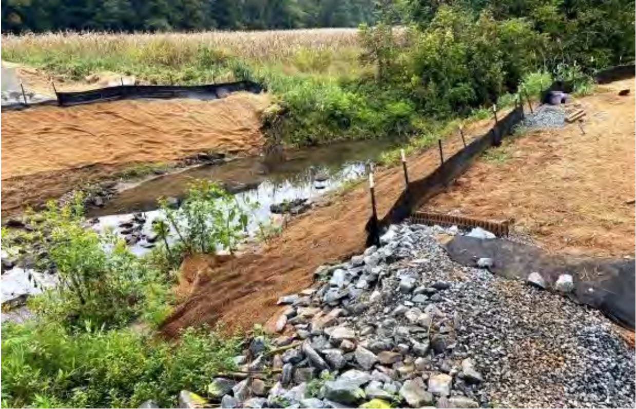
Photo- Bridge #64 over Beaverdam Creek- Additional Silt Fence (9/16/2021)