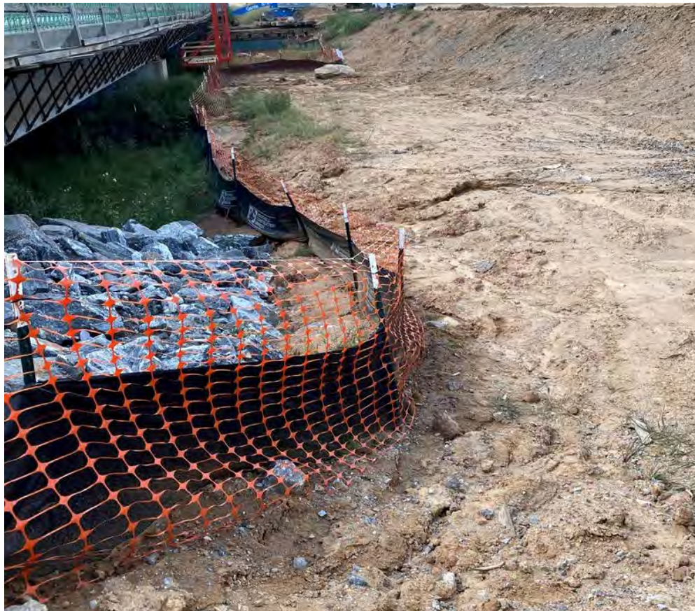
Photo- Safety Fence draped on the upstream side of silt fence (9/29/21)