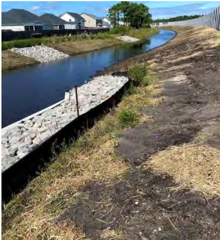
Photo – Culvert and additional pipe installed, and ditch graded. (9/23/21)