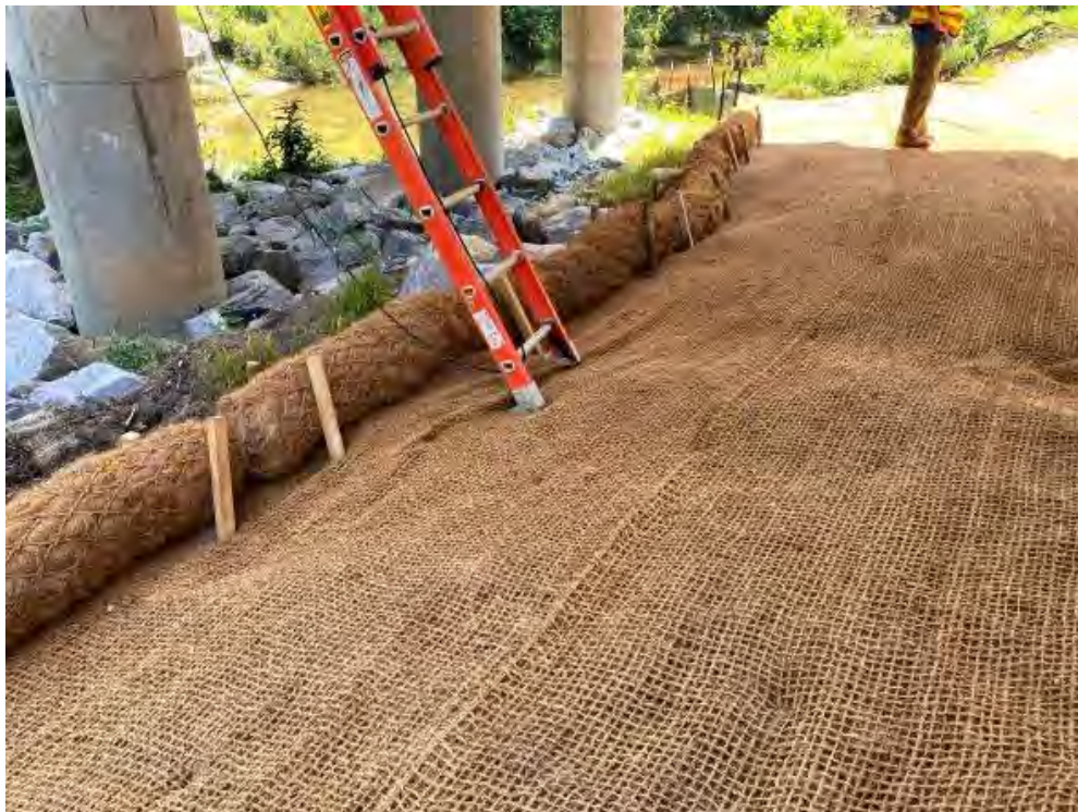
Photo- BR-0125 : Coir Fiber laid as matting and Wattles installed (8/25/2021)