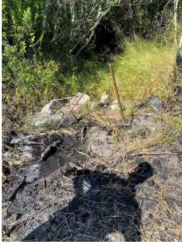
Photo - Overwhelmed TRSC-A with minor sediment loss at Borrow Pit. (9/23/21)