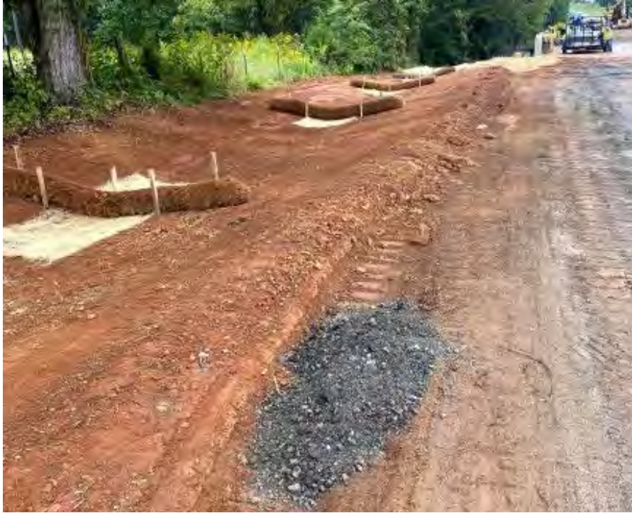
Photo- Bridge #255 over Grant's Creek – Coir Fiber Wattles with PAM (9/16/2021)