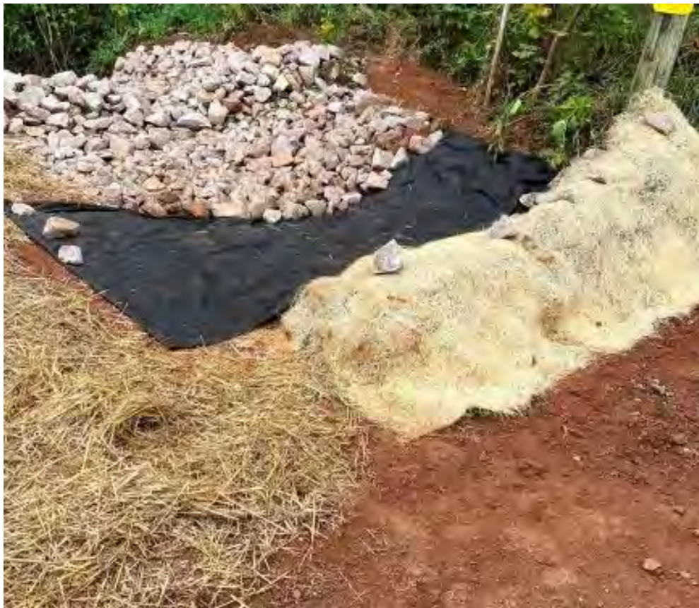
Photo- Bridge #255 over Grant's Creek - Check Dam susceptible to wash around (9/16/2021)