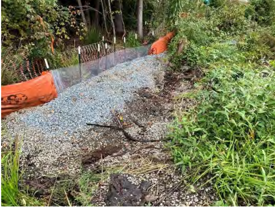
Photo- Special Sediment Control Fence adjacent to Wetlands (9/17/21)