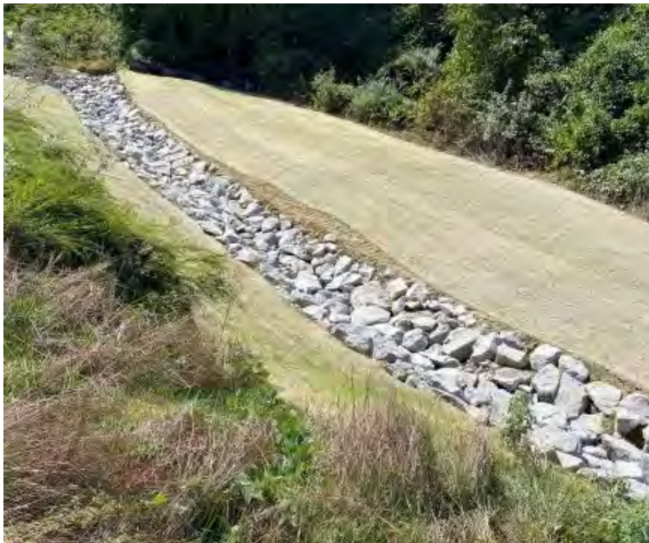
Photo- Basin removed and Permanent Ditch recently completed (10/13/21)