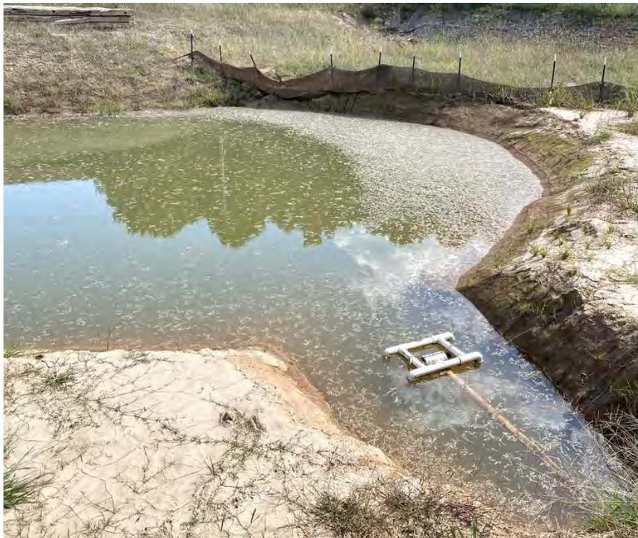
Photo- Basin needing maintenance and skimmer outlet did not daylight (9/29/21)