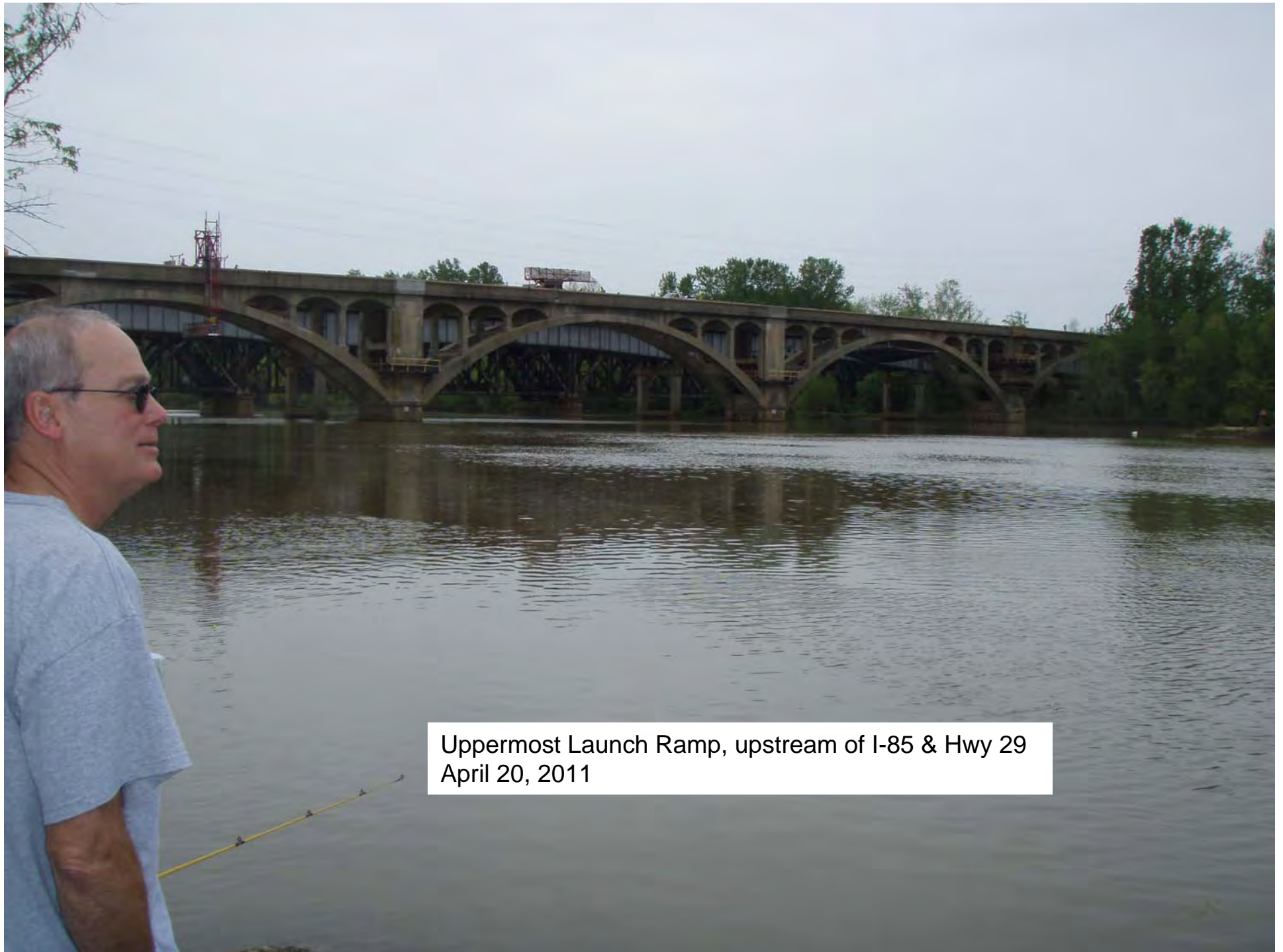
Uppermost Launch Ramp, upstream of I-85 & Hwy 29 April 20, 2011