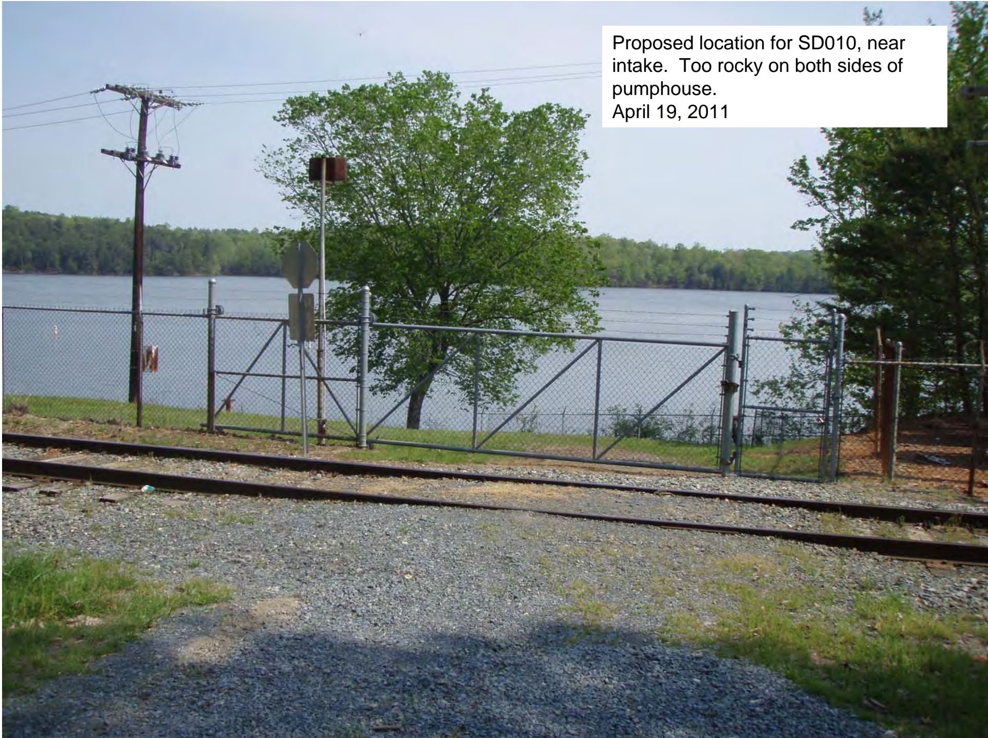
Proposed location for SD010, near intake. Too rocky on both sides of pumphouse. April 19, 2011