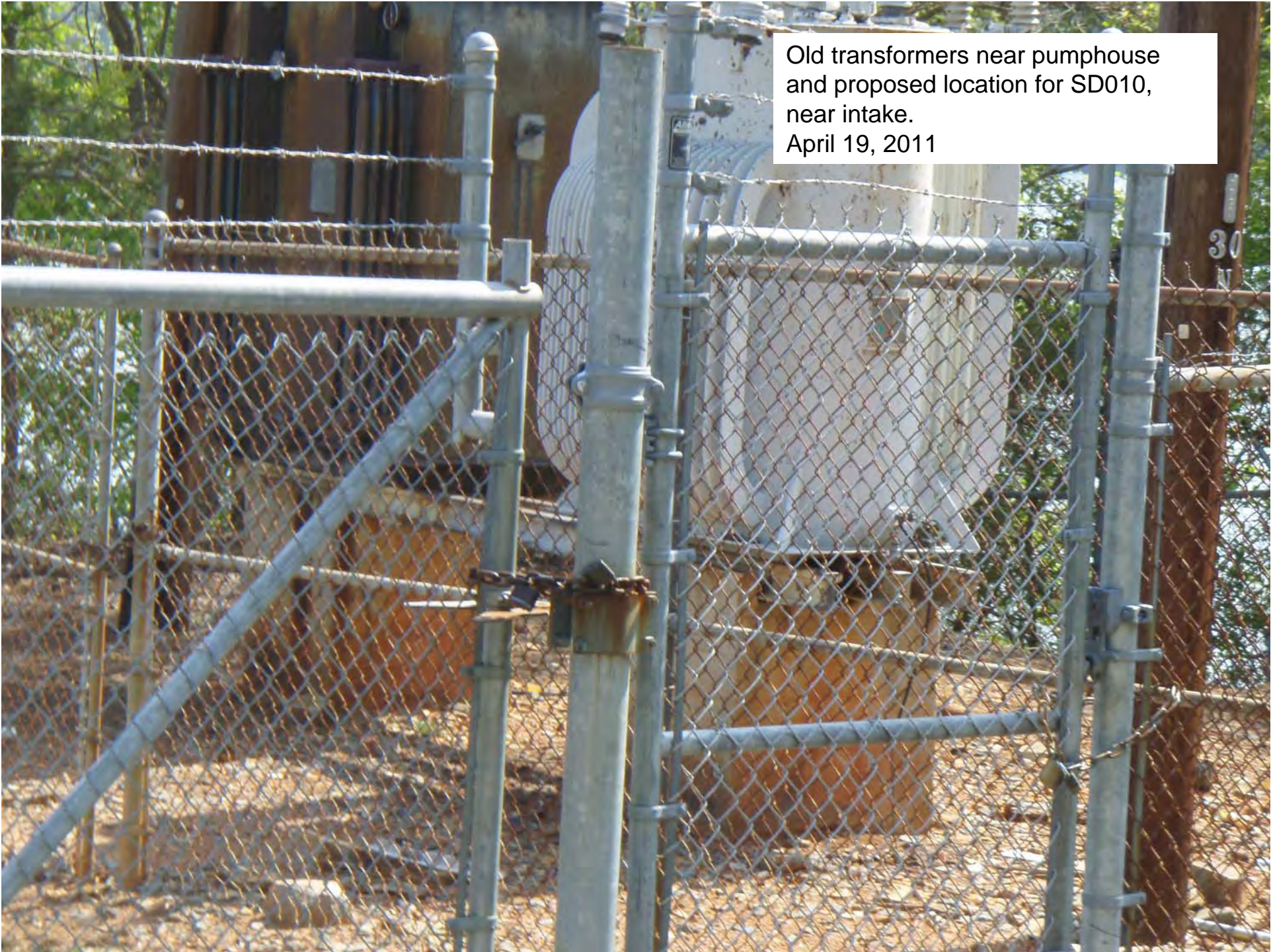
Old transformers near pumphouse and proposed location for SD010, near intake. April 19, 2011