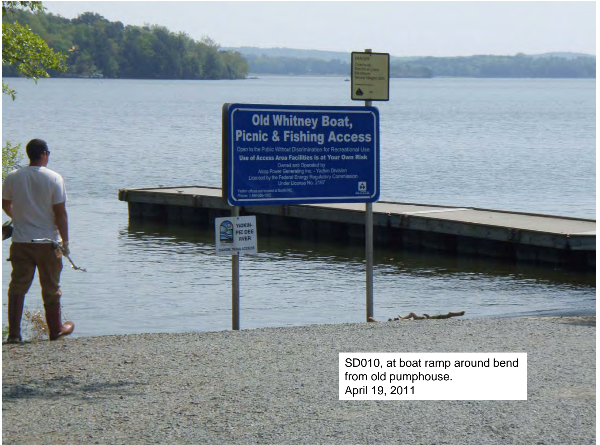
SD010, at boat ramp around bend from old pumphouse. April 19, 2011