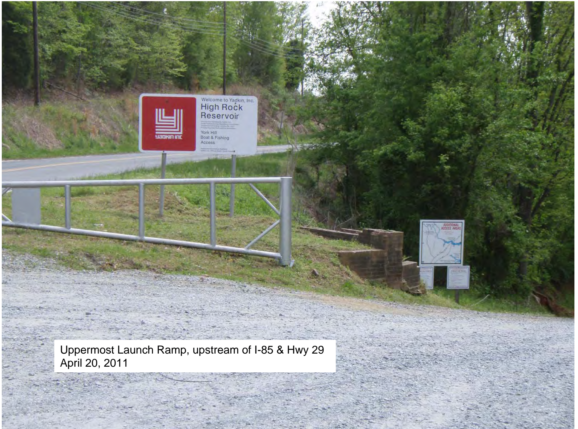
Uppermost Launch Ramp, upstream of I-85 & Hwy 29 April 20, 2011