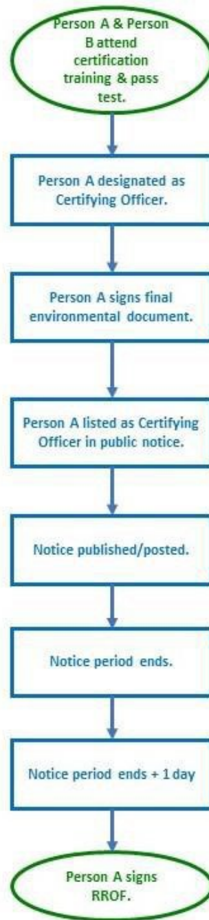
Figure 1.2. Flowchart for Certifying Officer Signatures