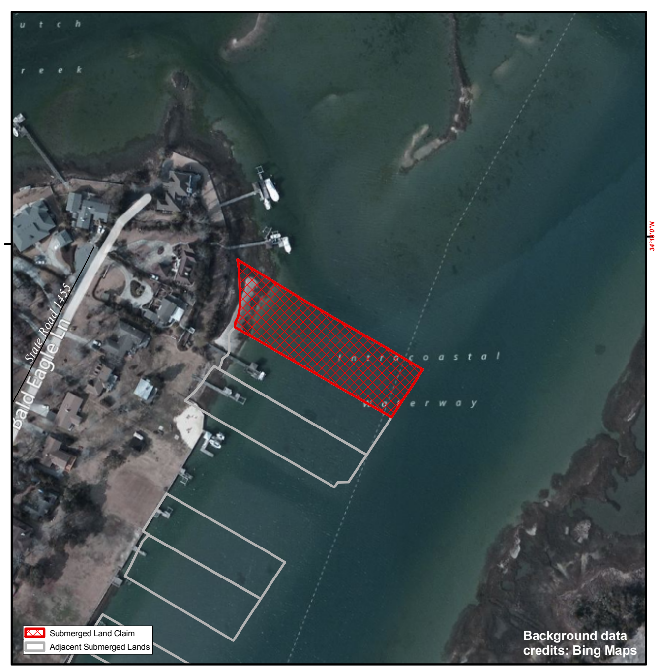
Disclaimer: This map is not a certified land survey and is not intended to comply with North Carolina GS § 47-30. It is prepared for informational purposes only and is not to be used for legal descriptions or property transfers. North Carolina Division of Marine Fisheries makes no warranty, expressed or implied, concerning the accuracy, completeness, reliability of these data, and users are advised that use of this map is at their own risk.