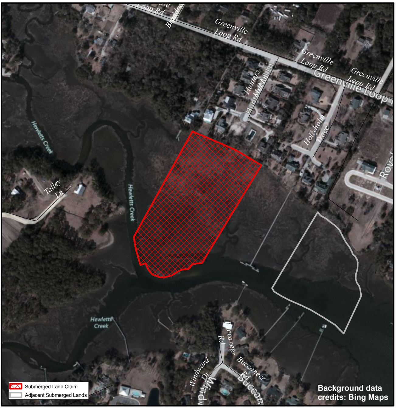
Disclaimer: This map is not a certified land survey and is not intended to comply with North Carolina GS § 47-30. It is prepared for informational purposes only and is not to be used for legal descriptions or property transfers. North Carolina Division of Marine Fisheries makes no warranty, expressed or implied, concerning the accuracy, completeness, reliability of these data, and users are advised that use of this map is at their own risk.