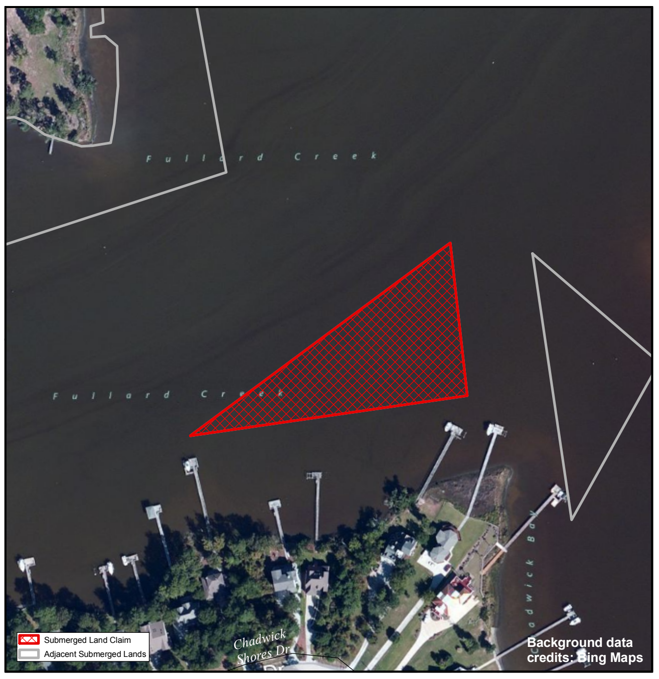
Disclaimer: This map is not a certified land survey and is not intended to comply with North Carolina GS § 47-30. It is prepared for informational purposes only and is not to be used for legal descriptions or property transfers. North Carolina Division of Marine Fisheries makes no warranty, expressed or implied, concerning the accuracy, completeness, reliability of these data, and users are advised that use of this map is at their own risk.