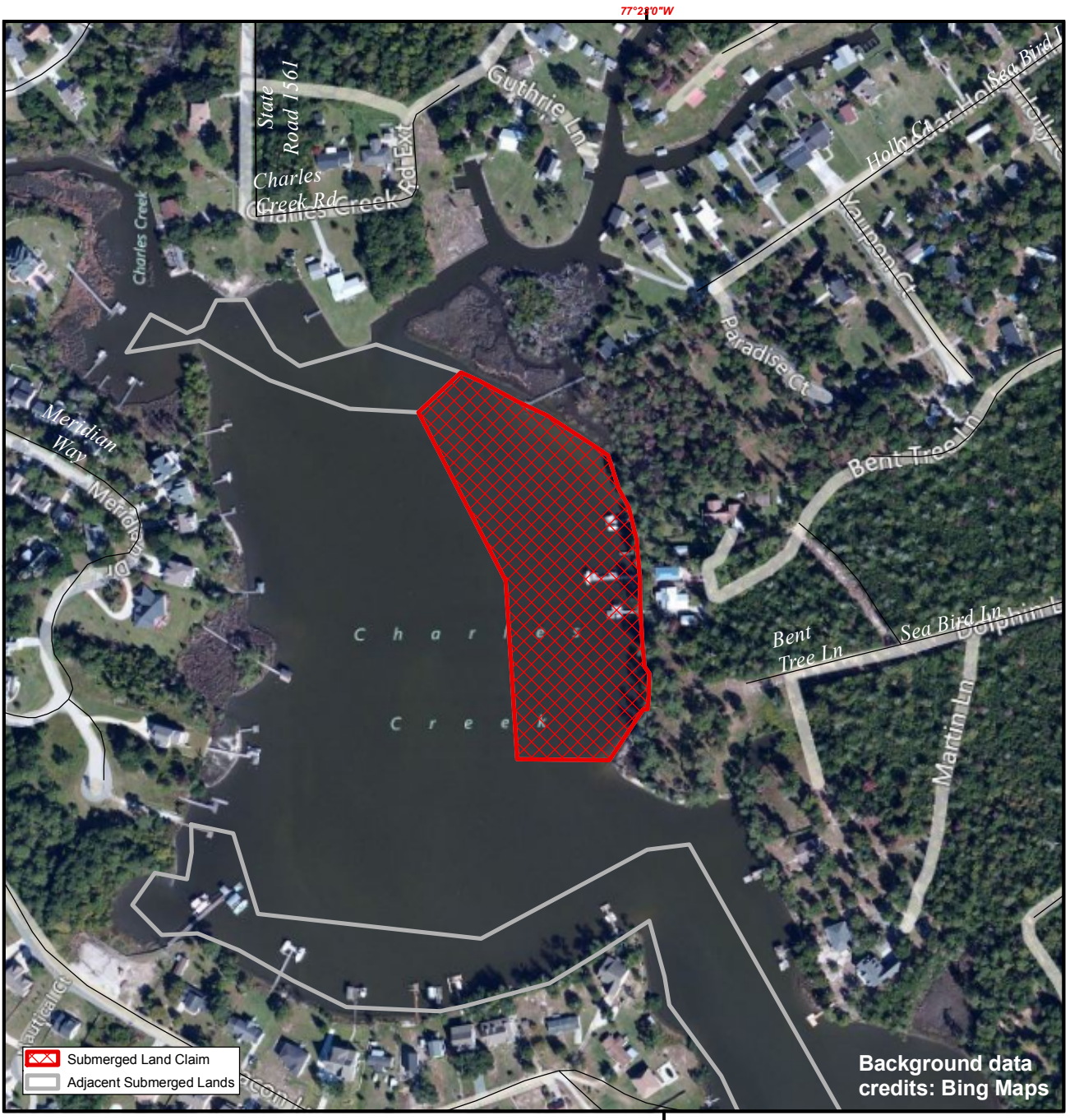
Disclaimer: This map is not a certified land survey and is not intended to comply with North Carolina GS § 47-30. It is prepared for informational purposes only and is not to be used for legal descriptions or property transfers. North Carolina Division of Marine Fisheries makes no warranty, expressed or implied, concerning the accuracy, completeness, reliability of these data, and users are advised that use of this map is at their own risk.