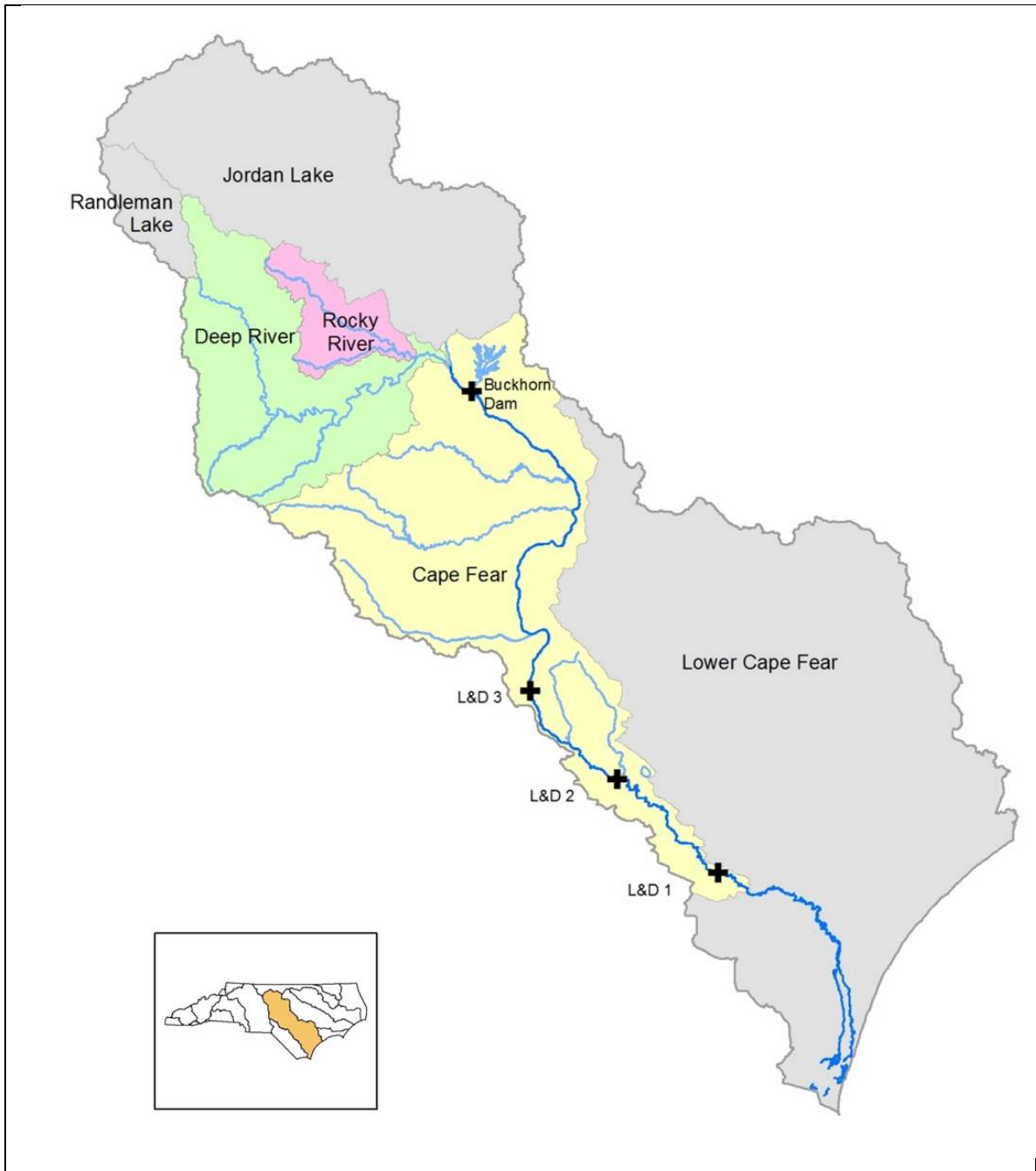
Figure 3. Cape Fear River Basin. (Areas in color represent the Central portion of the Cape Fear River Basin for which nutrient criteria are proposed. L&D = Lock and Dam)

Notes: The subwatersheds in gray either have nutrient management plans (i.e., Jordan Lake and Randleman Lake) or are areas that have streams draining to the portion of the Cape Fear River downstream of Lock and Dam 1 (i.e., Lower Cape Fear). Thus, the areas in gray are not in the area designated as the Central portion of the Cape Fear River Basin. The subwatersheds in color are either listed as impaired for chlorophyll- a , or are of concern for nutrient over enrichment and comprise the “Central Portion of the Cape Fear River Basin.”