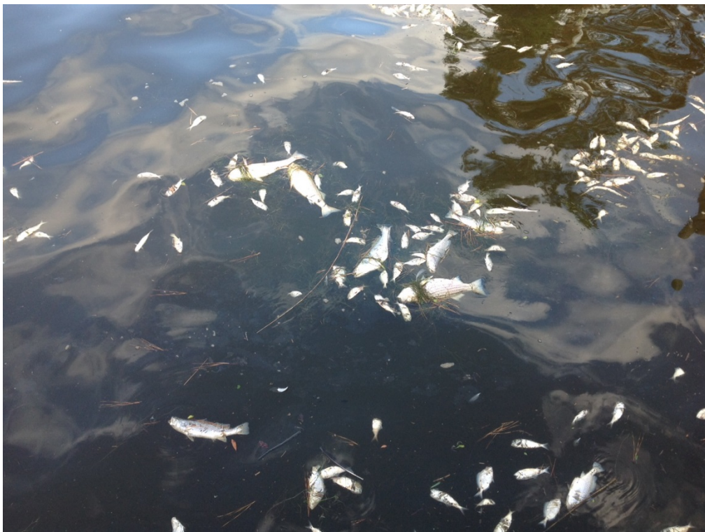
Multi-species fish kill, Neuse River at Cherry Branch Ferry, September, 2014.

North Carolina Department of Environment and Natural Resources Division of Water Resources Raleigh, NC