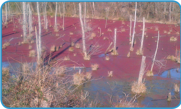
Azolla covering Albemarle City Lake