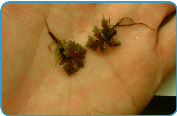
Red and green velvety leaves of Azolla