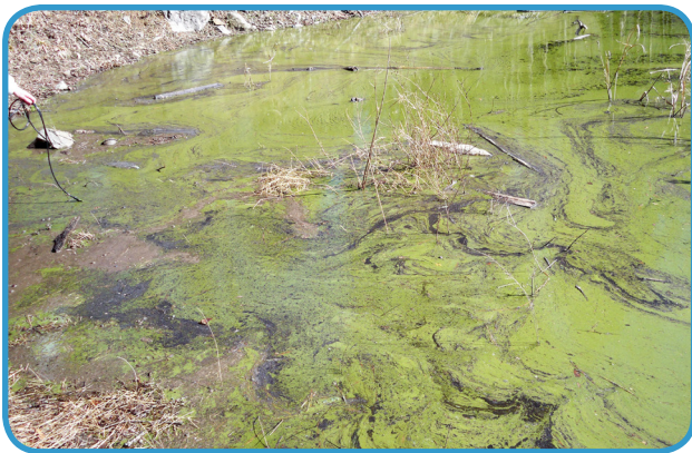
Cyanophyta (filamentous blue-greens)