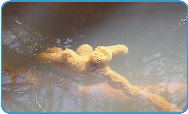
Iron bacteria's orangish-red coating