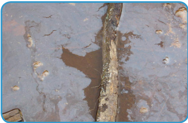
Blue film caused by iron bacteria