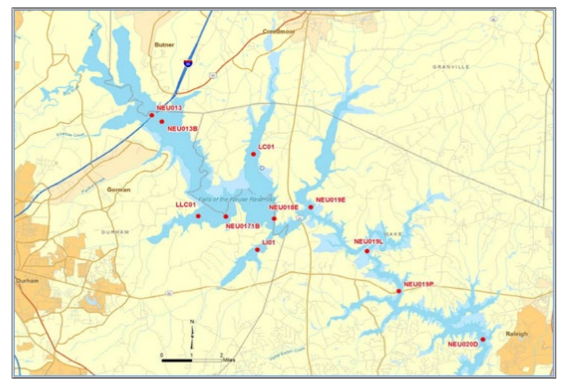
Figure 1: Falls Lake Monitoring Stations