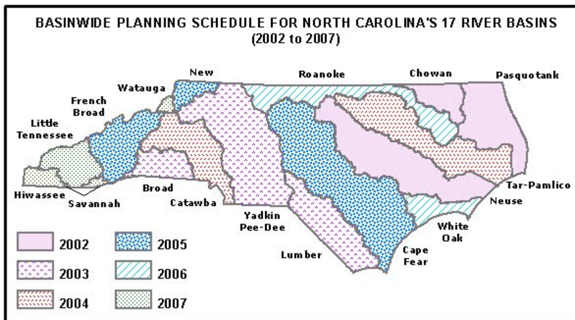
Figure A-1 Basinwide Planning Schedule (2002 to 2007)

Basinwide water quality planning is a nonregulatory, watershed-based approach to restoring and protecting the quality of North Carolina's surface waters. Basinwide water quality plans are prepared by the NC Division of Water Quality (DWQ) for each of the 17 major river basins in the state, as shown in Figure A-1 and Table A-1. Preparation of an individual basinwide water quality plan is a five-year process, which is broken down into three major phases as presented in Table A-2. While these plans are prepared by the Division of Water Quality, their implementation and the protection of water quality entail the coordinated efforts of many agencies, local governments and stakeholder groups in the state. The first cycle of plans was completed in 1998, but each plan is updated at five-year intervals.