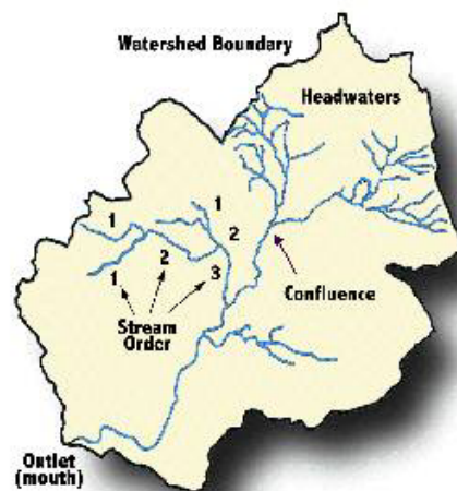
Figure 17 Diagram of Headwater Streams within a Watershed Boundary

Many streams in a given river basin are only small trickles of water that emerge from the ground. A larger stream is formed at the confluence of these trickles (Figure 17). This constant merging eventually forms a large stream or river. Most monitoring of fresh surface waters evaluates these larger streams. The many miles of small trickles, collectively known as headwaters, are not directly monitored and in many instances are not even indicated on maps. These streams account for approximately 80 percent of the stream network and provide many valuable services for quality and quantity of water delivered downstream (Meyer et al., 2003). However, degradation of headwater streams can (and does) impact the larger stream or river.