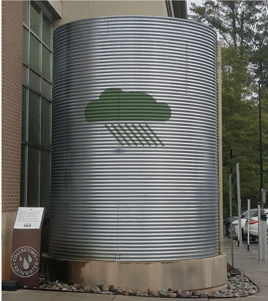
Rainwater Harvesting Practice - Raleigh

Developed by the N.C. Division of Water Resources Nonpoint Source Planning Branch