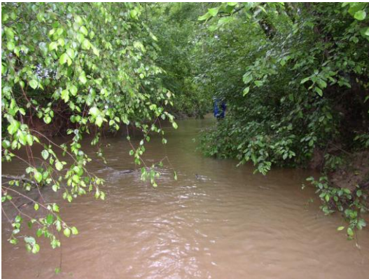
Reedy Fork at SR 2269, upstream view.

This stream was used as a reference site. It is similar in size and geology to Little Alamance Creek, and has the same types of habitat degradation. The banks were badly eroded and the channel was filled with sand. Riparian areas were broken, and poor instream habitat. The habitat score was 43, however, conductivity was measured at 90 \mu\text{mhos/cm} .