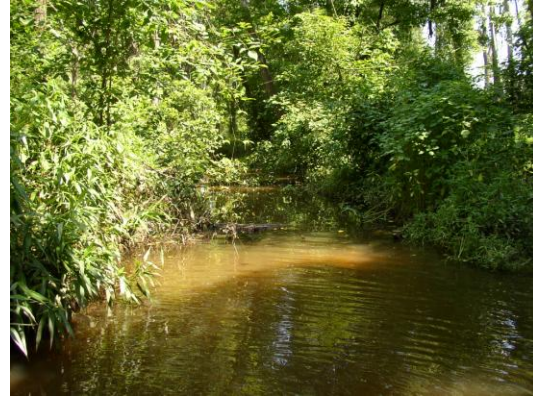
W Prong L Alamance Cr. at Edgewood Ave.