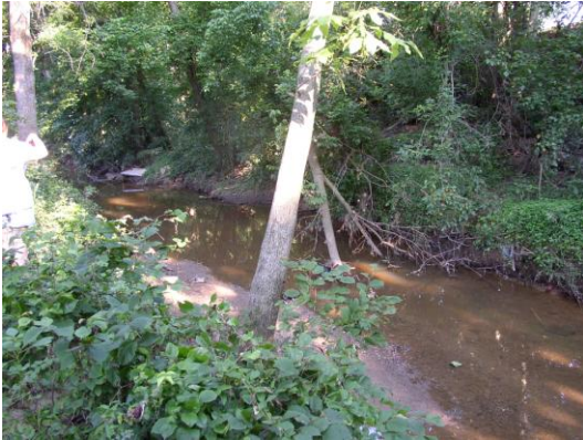
Bowden Branch at SR 2312, upstream view.

Bowden Branch is a tributary to Little Alamance Creek that drains the eastern portion of the catchment near Graham. This stream was considered as a possible benthos site, but was not sampled due to lack of flow. It was typical of other small streams in the area with high, steep banks that were badly eroded, and a sandy substrate with little instream habitat. Water chemistry measurements indicated a conductivity value of 161 \mu\text{mhos} .