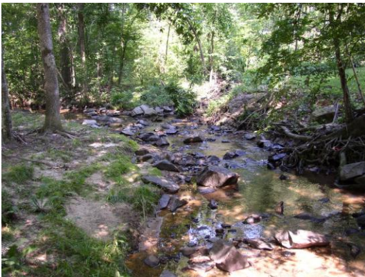
Coble Brook at Engleman Ave., upstream.

Coble Brook drains a largely residential area of west Burlington. Together with West Prong of Little Alamance Creek, this stream forms Mays Lake. At this site, the stream was only 3 meters wide with a drainage area of 0.9 square miles. A Qual 4 sample was taken here.