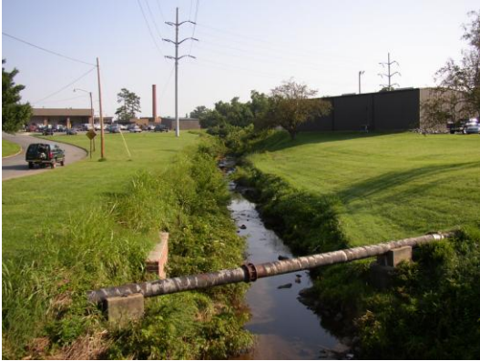
Willowbrook Creek at Mebane Street Upstream view of Burlington Public Works.