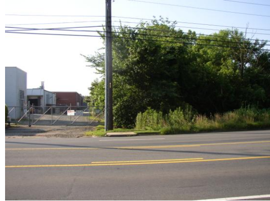
Willowbrook Creek at Mebane Street Downstream view; stream is hidden by the trees on the right side of the photo.