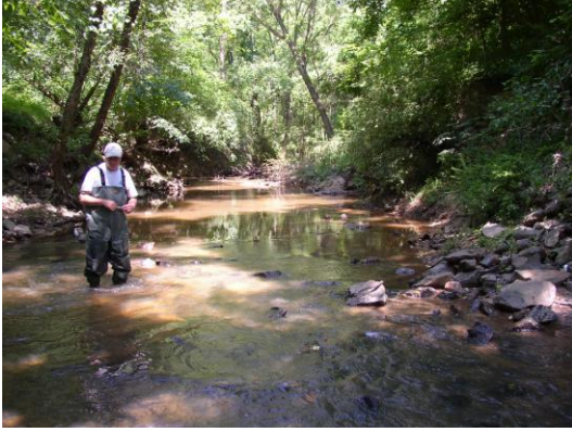
Little Alamance Creek at NC 49, upstream.