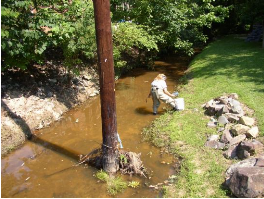
Gant Brook at Woodland Avenue.