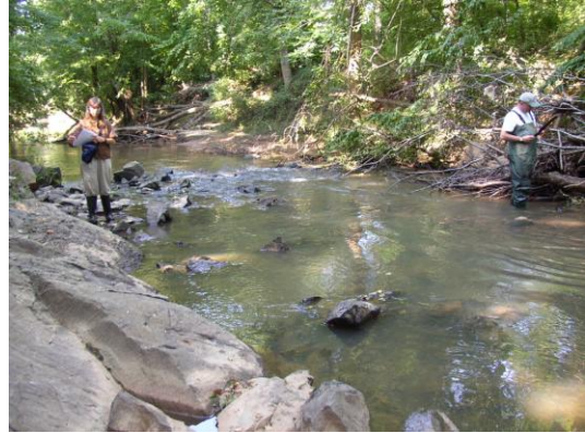
Little Alamance Cr. at SR 2309, downstream.