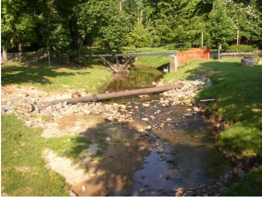
Little Alamance Cr. at Burlington city park.