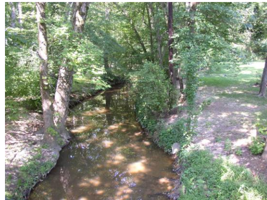
Coble Brook at Engleman Ave., downstream.

The substrate here was mostly sand, however, there was one riffle area that contained a significant amount of boulder and rubble. Downstream the stream bottom was all sand and the streambed appeared channelized. The banks were unstable and the riparian zone was a combination of a few larger trees and mowed lawns on both sides. The habitat score at this site was 56. The conductivity value of 90 \mu\text{mhos/cm} was the lowest recorded in this survey.