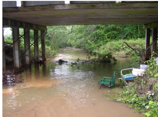
Reedy Creek at SR 2269, downstream view.