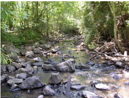
Little Alamance Creek at Overbrook Road, looking upstream.

Conditions improved slightly as the stream approached Overbrook Road. The riparian zone had more trees and shrubs and banks were more stable. The substrate had a large area of boulder and rubble that appeared to have been placed there. Further downstream, the substrate was again sand and gravel. The rocks were embedded, and other instream habitat was poor. The habitat score was 64. Conductivity was 185 \mu\text{mhos/cm} .