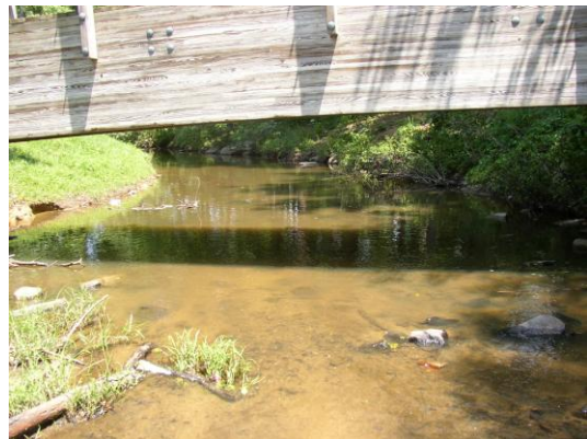
Little Alamance Creek at Overbrook Road, looking downstream.