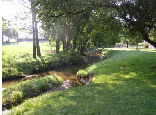
Little Alamance Cr. at Burlington city park.

Conditions improved slightly as the stream approached Overbrook Road. The riparian zone had more trees and shrubs and banks were more stable. The substrate had a large area of boulder and rubble that appeared to have been placed there. Further downstream, the substrate was again sand and gravel. The rocks were embedded, and other instream habitat was poor. The habitat score was 64. Conductivity was 185 \mu\text{mhos/cm} .