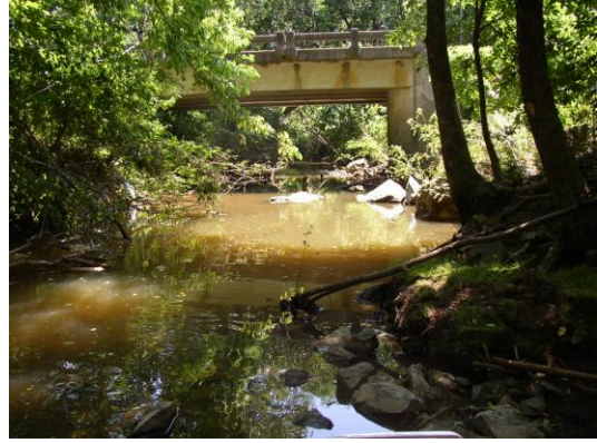
Little Alamance Creek at NC 49, downstream.