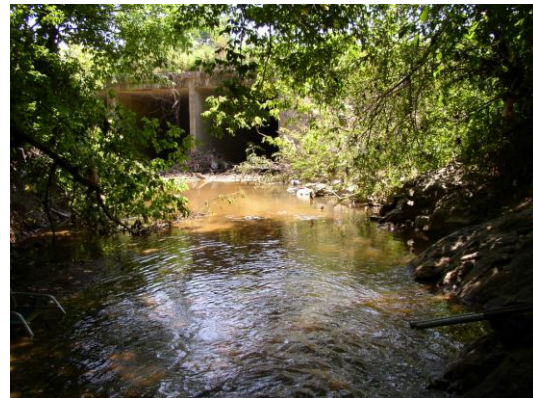
Little Alamance Creek at I- 85, downstream.