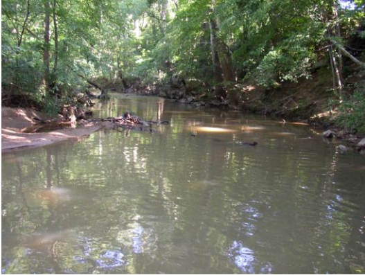
Little Alamance Creek at SR 2309, upstream.