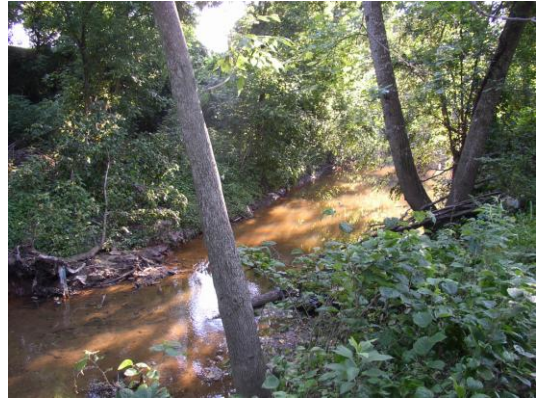
Bowden Branch at SR 2312, downstream view.