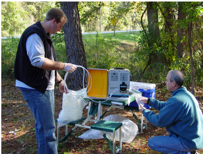
Pumping a Hg Field Blank sample using clean/dirty hands procedure.

Trace-level mercury sampling (total and monomethyl) was conducted using EPA's Method 1669 (Sampling Ambient Water for Trace Metals at EPA Water Criteria Levels). This method allowed detection levels at three orders of magnitude lower than the method currently used by DWQ for water and sediment. This water sampling methodology includes the use of clean hands/dirty hands procedures and peristaltic pumping of the sample through PTFE tubing into laboratory cleaned and certified Teflon bottles. This methodology significantly reduces the risk of contamination at these low levels of detection. The method is performance based with strict adherence to QA procedures including field and laboratory blanks. Brooks Rand LLC in Seattle, Washington performed trace-level analysis and equipment cleaning and certification.