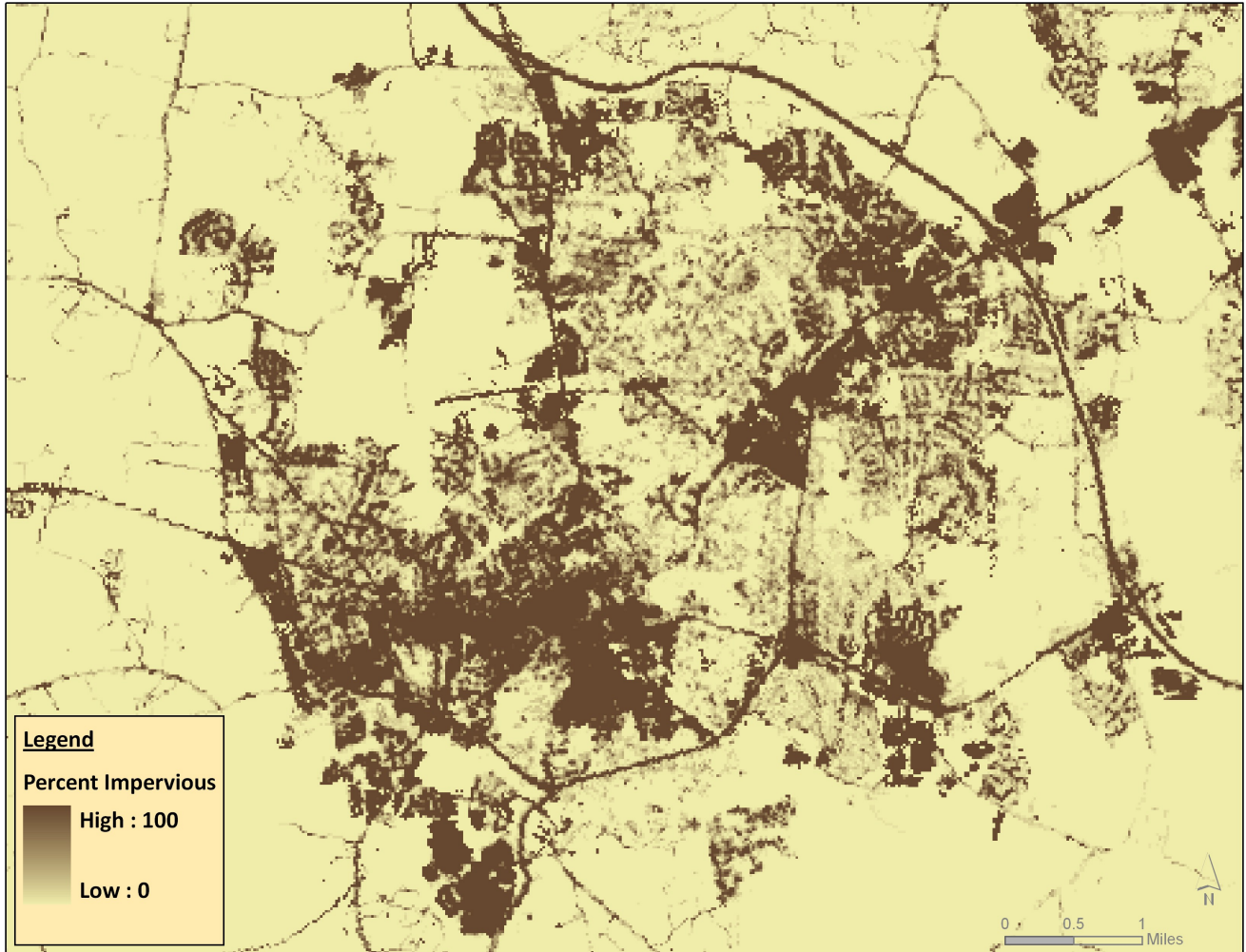
Figure 1 - Impervious Surface data for Chapel Hill, NC

percentage of impervious surface covering the land area. Figure 2 provides a close up of impervious surface data in Chapel Hill. Roads, buildings, urban centers, and neighborhoods can be seen with the impervious cover data.