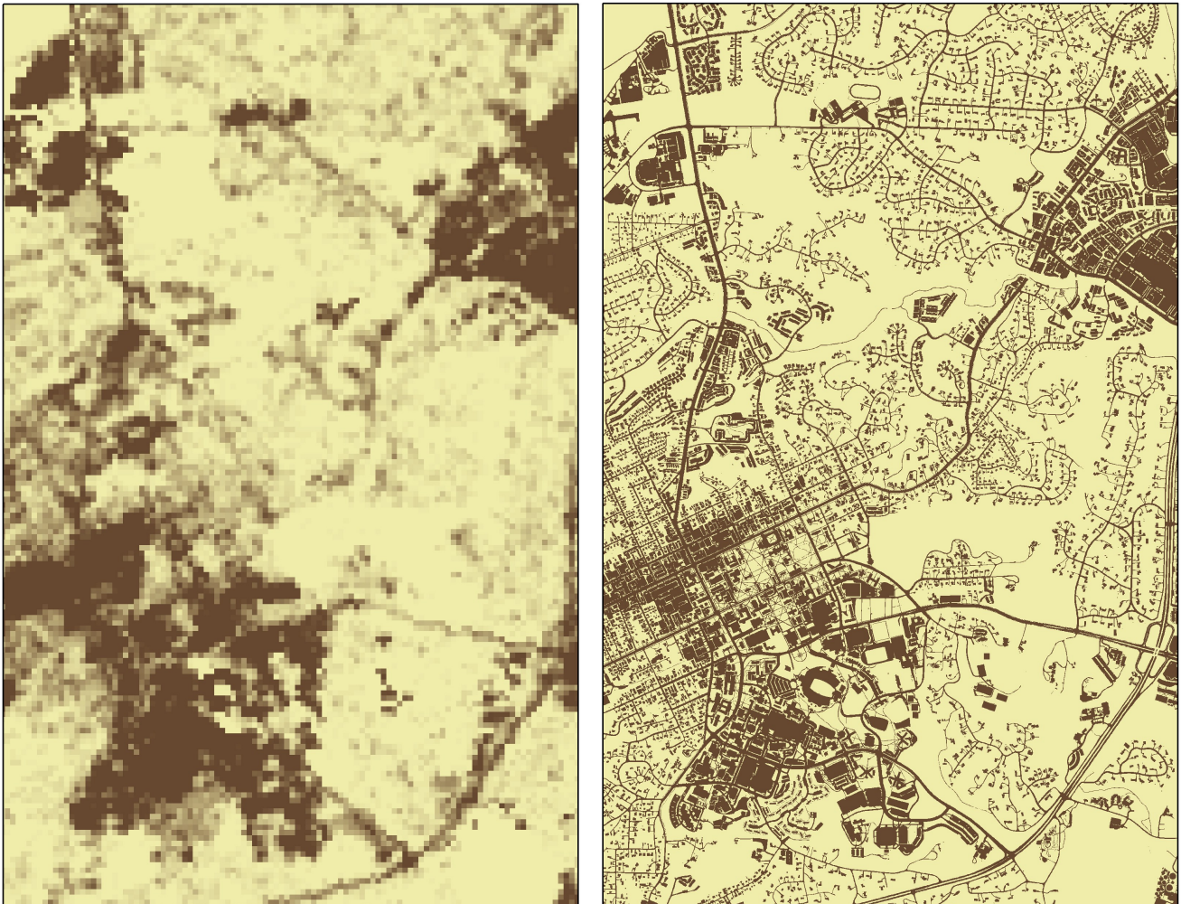
Figure 3 - A comparison of the satellite imagery with planimetric data

Planimetric data from the Town of Chapel Hill was also sampled with the different scale grids. The planimetric data is created from digitizing site plans and is the most accurate source of impervious cover data available. Figure 4 shows the two data types for the same area. The samples were then compared to determine accuracy of the MRLC impervious cover data.