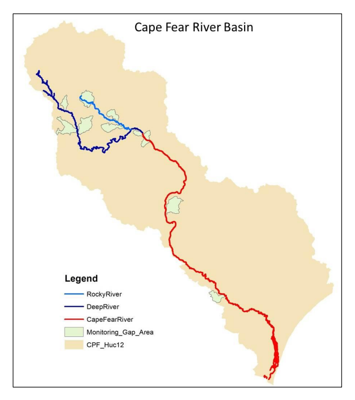
Figure 1. Proposed watershed locations for routine water quality monitoring study.