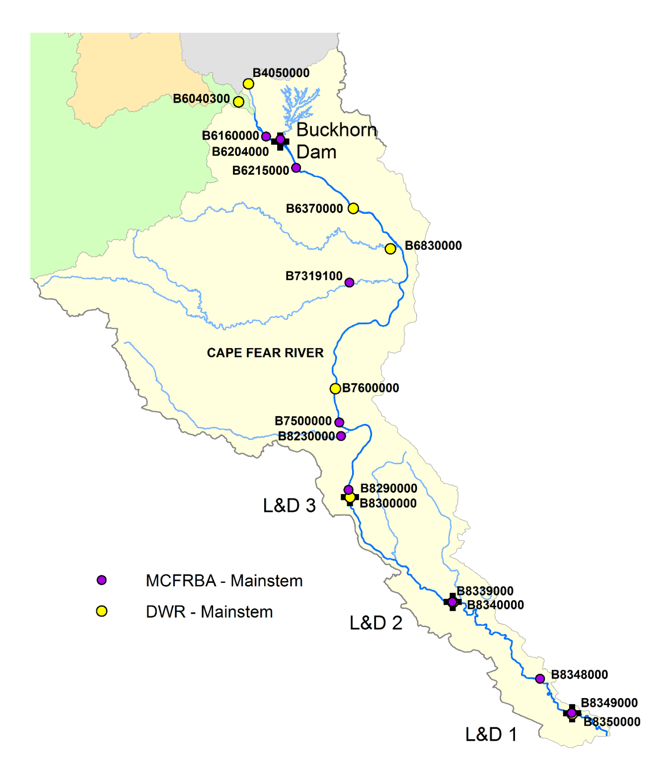
Figure 3. Mainstem Cape Fear River - Monitoring stations selected for additional monitoring