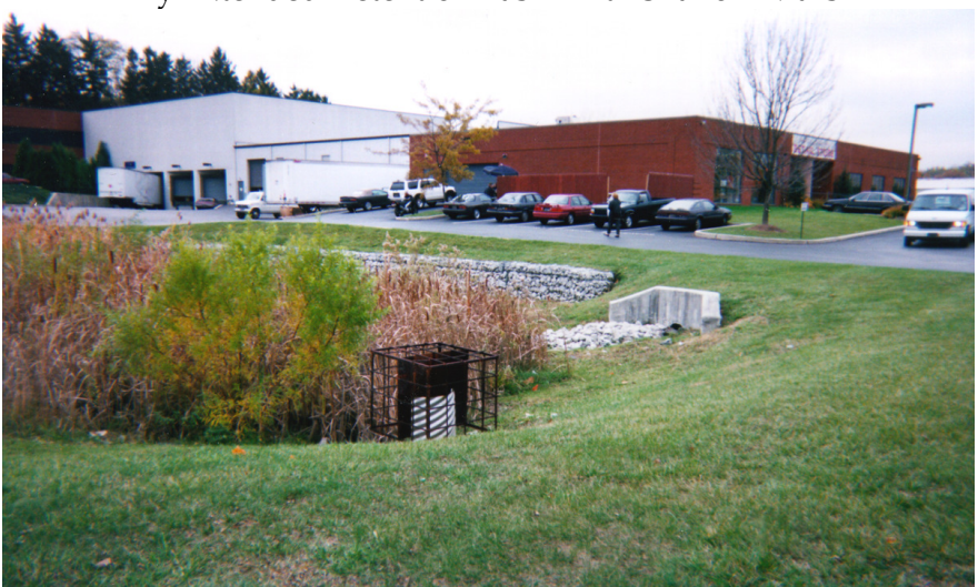
Figure 17-1 Dry Extended Detention Basin with Shallow Marsh