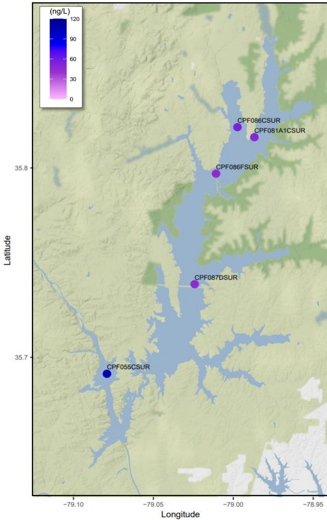
Figure 3. Per- and polyfluoroalkyl concentrations at Jordan lake monitoring stations. Only values greater than the PQL ( 2 \text{ ng l}^{-1} ).